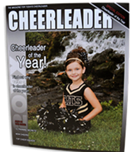
Magazine Cover Trading Cards