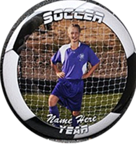
3\frac{1}{2} " button