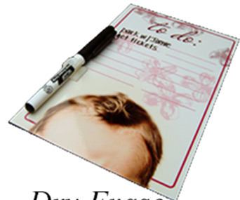
Dry Erase Board